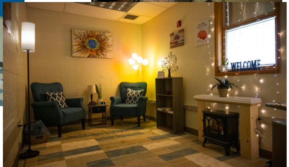
The Mental Health Therapy Room at The Health Center at Garrison Middle School