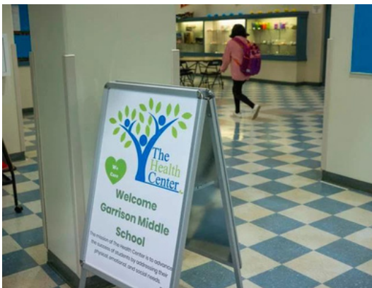
A sign introduces visitors to The Health Center at Garrison Middle School